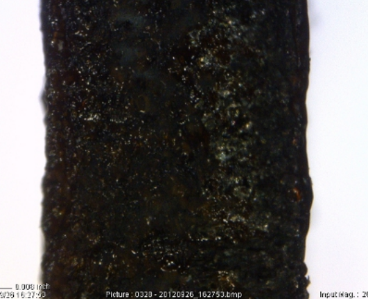
Figure 3: Micrograph of a laser cut polycarbonate edge using the typical method

Utilizing a multi-pass method, you can decrease the amount of char created while cutting polycarbonate. Starting with the Materials Database settings, then increase the speed such that after 2-4 passes the part can be easily popped out by hand. This method is useful on thicker polycarbonate when you do not have a high enough wattage laser to use the Smooth Edge method.