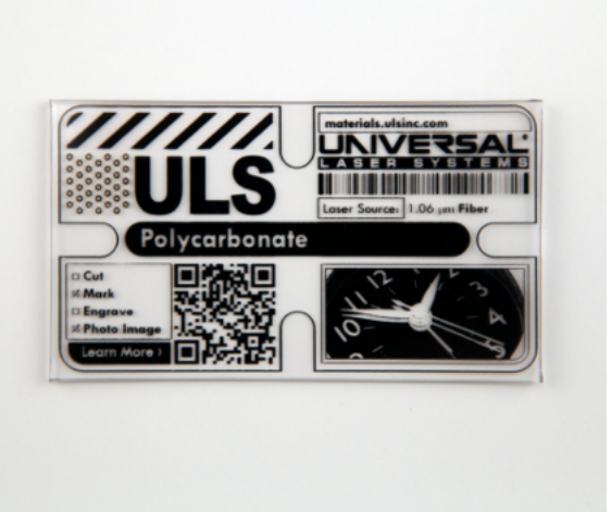
Figure 1: Fiber laser marked sample

Creating a surface mark on polycarbonate is very straight-forward using the fiber laser and the standard Materials Database settings for polycarbonate. Using image density 6 gives the highest contrast mark. The 4.0 lens is recommended for improved uniformity in the mark. This also helps with samples that are not completely flat or are slightly distorted because the focal tolerance for the 4.0 lens is +/-0.04".