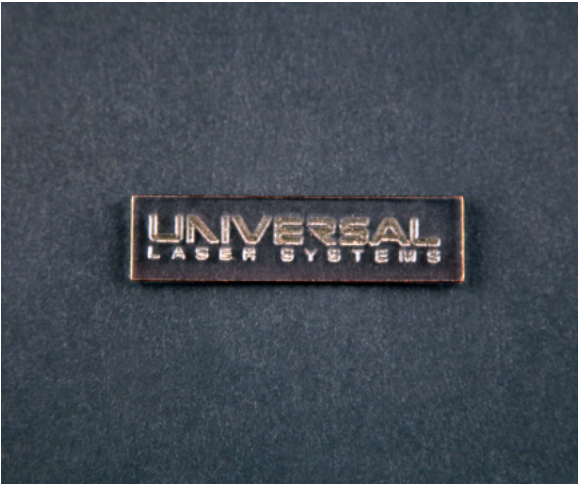
Figure 2: CO<sub>2</sub> laser marked sample

Creating a surface mark on polycarbonate can be done with any lens option (HPDFO, 1.5, 2.0, 2.5, 3.0 or 4.0). Your lens should be selected based on the level of detail required for the job (spot size) and any focal tolerance or focal distance requirements due to part shape.