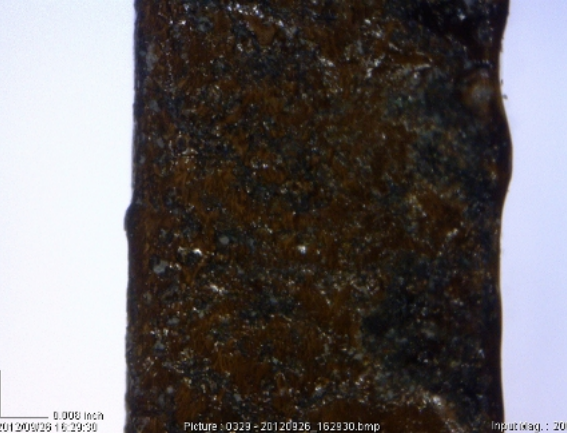
Figure 4: Micrograph of a laser cut polycarbonate edge using the Multi-Pass Method